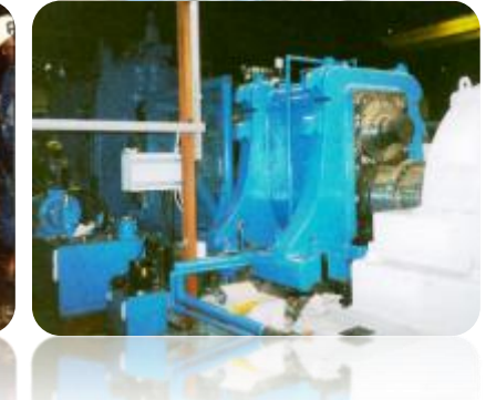
G&G Engineering are totally committed to providing quality of service.

We are experts in the fields of mechanical engineering, management of engineering projects, steel fabrications and on-site engineering and pride ourselves on exceptional customer focus.