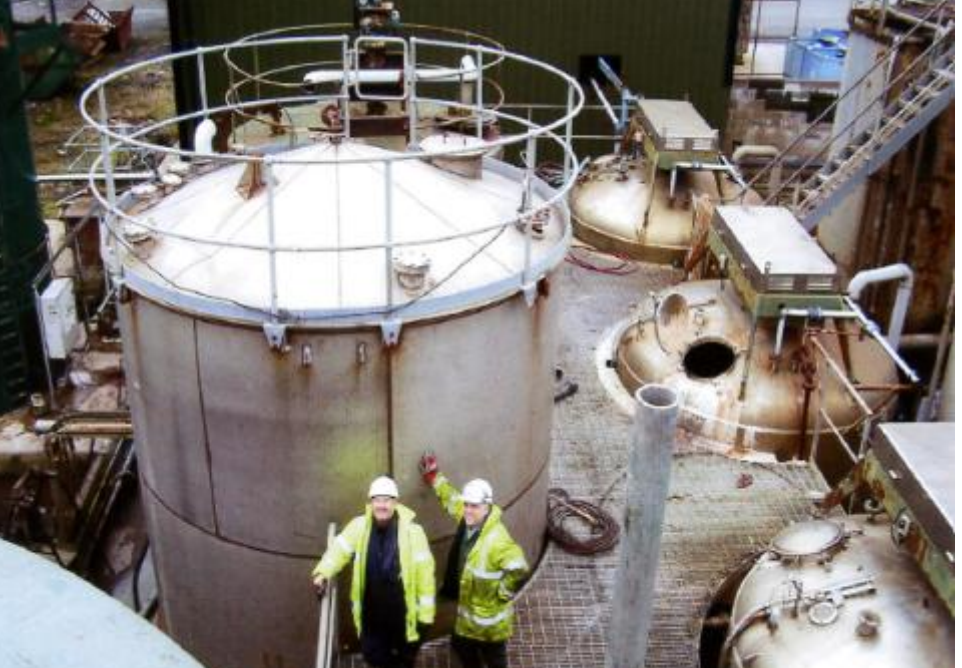
G&G - On-site chemical storage tank removal